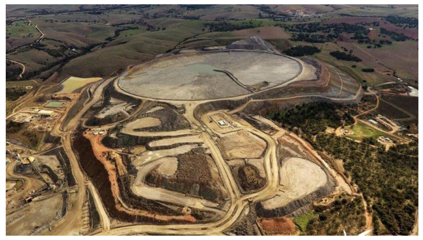
The Kanmantoo copper mine pictured in 2017.

Meanwhile Hillgrove shares surged last week after the company released promising drilling results at Kanmantoo.